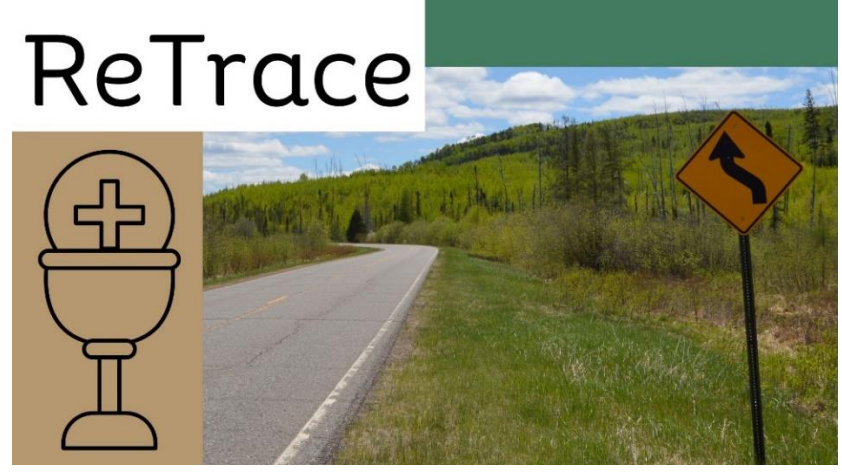
~ Welcome Visitors! ~

We are glad that you chose to join us for worship this morning. We hope that whoever you are, wherever you are on life's journey, you will feel welcome here.